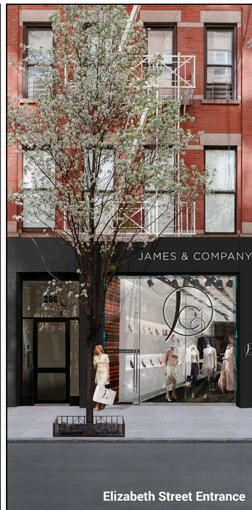
Elizabeth Street Entrance