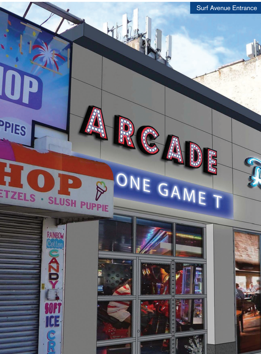
Surf Avenue Entrance